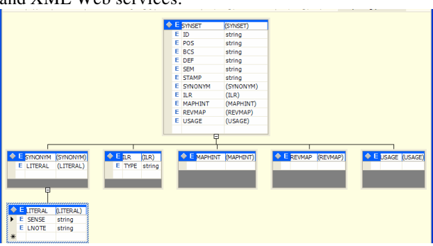
Figure 1 Serbian WN XSD schema in .NET XML designer. The element SEM is specific for SWN.

The C# programming language and Microsoft .Net were chosen as the basic development tools. Visual Studio .NET is a complete set of development tools for building ASP Web applications, XML Web services, desktop applications, and mobile applications. Visual Basic .NET, Visual C++ .NET, Visual C# .NET, and Visual J# .NET all use the same integrated development environment (IDE), which allows them to share tools and facilitates the creation of mixed-language solutions. In addition, these languages leverage the functionality of the .NET Framework, which provides access to key technologies that simplify the development of ASP Web applications and XML Web services.