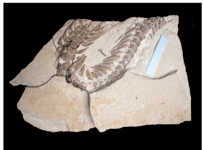
Fig. 2. Pachyostotic snake (Pachyophiidae NHMBEO MV 280) from Bosnia and Herzegovina.