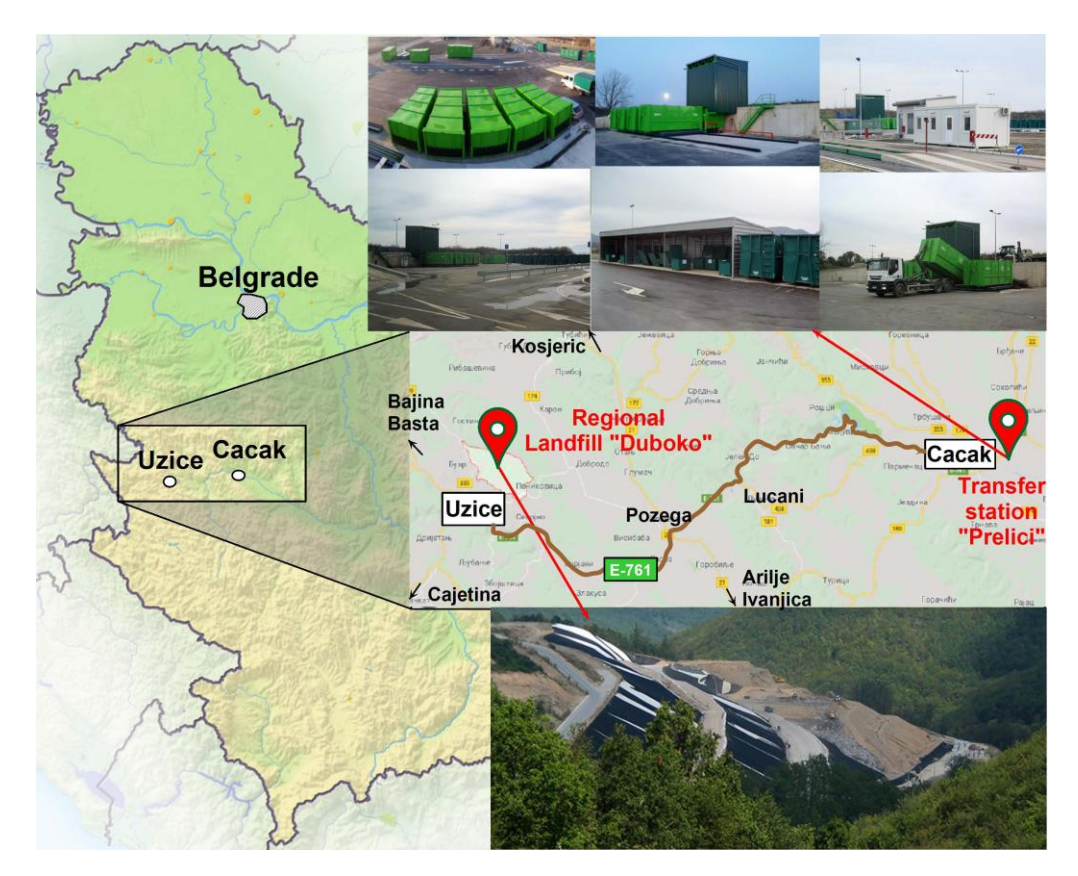
Figure 1. The locations of the transfer station "Prelici" and regional landfill "Duboko"

transported and disposed daily at regional landfill "Duboko" which is used by eight more municipalities, and the landfill itself is located close to the city Uzice (Figure 1).