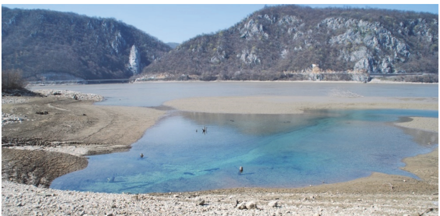
Fig. 3 Hajdučka Vodenica Spring

East of central Miroč, there is a karst aquifer called Dževrinske Grede, formed in a narrow belt of Tithonian limestones. The rift extends to the south for about 18 km and its width varies from several meters to a maximum of 700 m. The limestones are squeezed between Proterozoic-Paleozoic schists to the west and Early Cretaceous marly sandstones to the east. They are extensively fractured and karstified, with a large number of karst features (Ćalić, 2008). The karst aquifer called Krečnjačke Grede gravitates towards the Derdap gorge and is drained via several small springs, the largest of which is located in Matovića Krš and its discharge is 3.0 l/s (Ćalić, 2008)