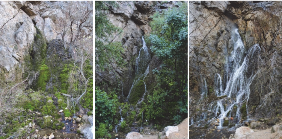
Fig. 2. Beg Bunar (minimum, average and maximum discharges)