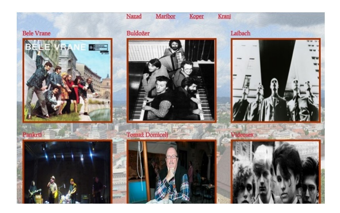
Figure 2. Example of a city page – Ljubljana

By activating the figure hyperlink, user is redirected to grad.php script which generates the list of performers from the specified city along with their respective figures. On the top of the page there is navigation (links to other cities of the same region) (Figure 2). In the background the figure of the city is generated. Every performer's figure is a hyperlink to bend.php script along with the proper parameter forwarding (Figure 3).