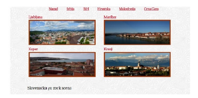
Figure 1. Example of a region page – Slovenia

First the basic composition was made with hierarchy architecture in its core. Instead of making HTML pages for each and every region, city or band, four PHP-scripts that consult the SQL-database were made and depending on the user's choice dynamically generate proper HTML content.