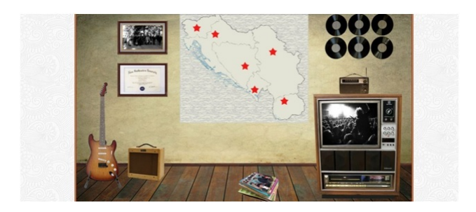
Figure 4. Home page display

As there are many possible outcomes of the pages content, it is necessary to find them an appropriate theme (color) to share. Main color was chosen to be a shade of red (\#dd2233), with strawberry themed heading along with the serif font prociono . Heading which all pages share consists of a main menu, audio player and search bar. They are let floating using the CSS, thus sacrificing the flexibility for looks, on the assumption that the site would be viewed from a standard resolution display.