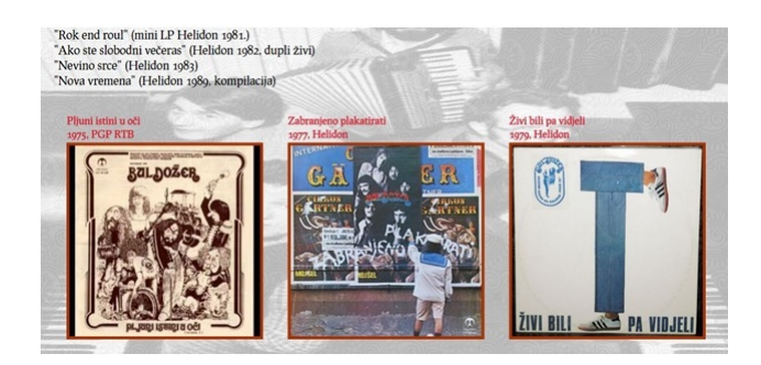
Figure 3. Example of a performer's page – Buldožer

The last script, bend.php has only one link – to go backwards. Role of this script is to generate the performer's biography and discography. For every album figure of the cover is generated, along with the name of the album, year of debut and its publisher company. After the page is loaded, a tune is automatically reproduced, with a large photo in the background.