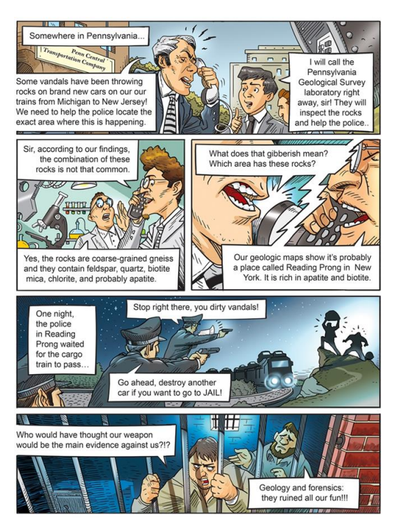
Figure 4. Comic book example (illustrated by Mijat Mijatović)